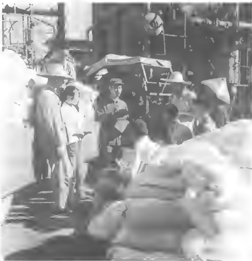
A seller of the Tanyang Chemical Fertilizer Plant collecting opinions of commune members.